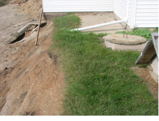
Washed away SSTS in eroded stream bank

You may also call the Minnesota Pollution Control Agency at 800-657-3864 with any SSTS flood related questions.