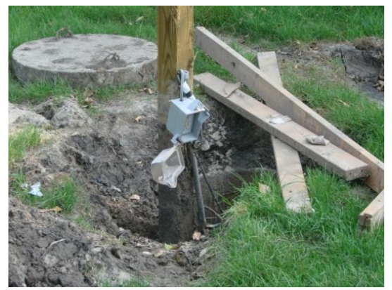
Flood damaged SSTS electrical box

If you observe either of the above after flood waters recede, contact a SSTS professional. They can be found through local advertizing or at: http://www.pca.state.mn.us/index.php/ water/water-types-and-programs/wastewater/subsurface-sewagetreatment-system-ssts/ssts-search.html.